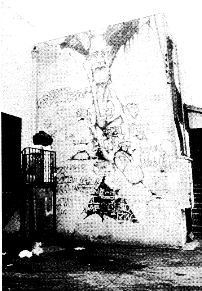
Fig. 1. Willie Herrón's The Cracked Wall.

words of Guillermo Gomez-Peña, an internationally respected artist and cultural critic, the “strength and originality of Chicano-Latino contemporary art in the US lies partially in the fact that it is often bicultural, bilingual, and/or biconceptual.” 8 This type of cultural flexibility allows Chicano and Latino artists operate within what both Gomez-Peña and cultural theorist Homi Bhabha have described as a third-space of cultural expression that confronts the postcolonial present. 9 The border, in this sense, becomes a site for intervening into the present that “demands an encounter with ‘newness’ that is not a part of the continuum of the past and present. It creates a sense of the new as an insurgent act of cultural translation.” 10