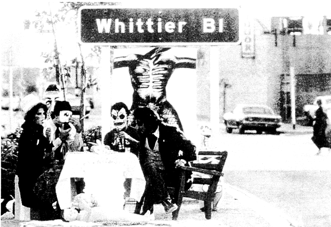
Fig. 2: Asco performing First Supper (After a Major Riot) in 1974 (image copyright held by Harry Gamboa and reprinted courtesy of the artist).

Asco returned to Whittier Boulevard several times over the following years and each new performance continued to explore the connections between the politics of identity, space, and place (see Figure 2). Additionally, each new performance introduced investigations into various media—film, muralism, and photography, thereby providing numerous opportunities to appropriate and re-articulate the image of the city. Through the use of site specific performances, film, and guerrilla tactics, Asco put the